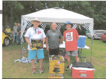
1st, 2nd & 3rd place winners with their awarded prizes!

WOW! What a turnout! There were SO many fantastic cars on display at our 3rd Annual Car Show! Thank you so much for everyone's help from set up to tear down to donations that were made to our church to benefit our missions groups! We couldn't do any of this without the help and support of our members and community!! Thank You Again!!