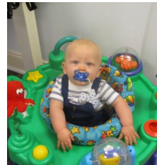
Vacation Bible School 2023